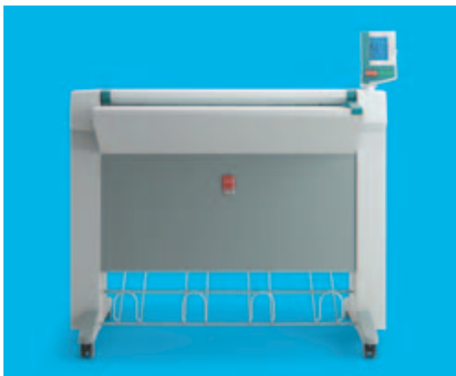
Océ TC4 (for original thickness up to .12 in. or 3 mm)